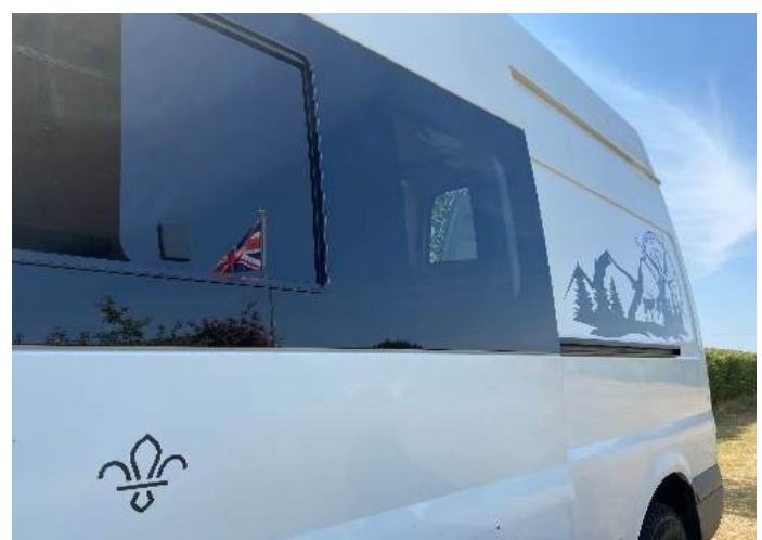
Casper at camp with 1 st Salhouse

“If you can find a path with no obstacles, it probably doesn't lead anywhere.” — Bear Grylls